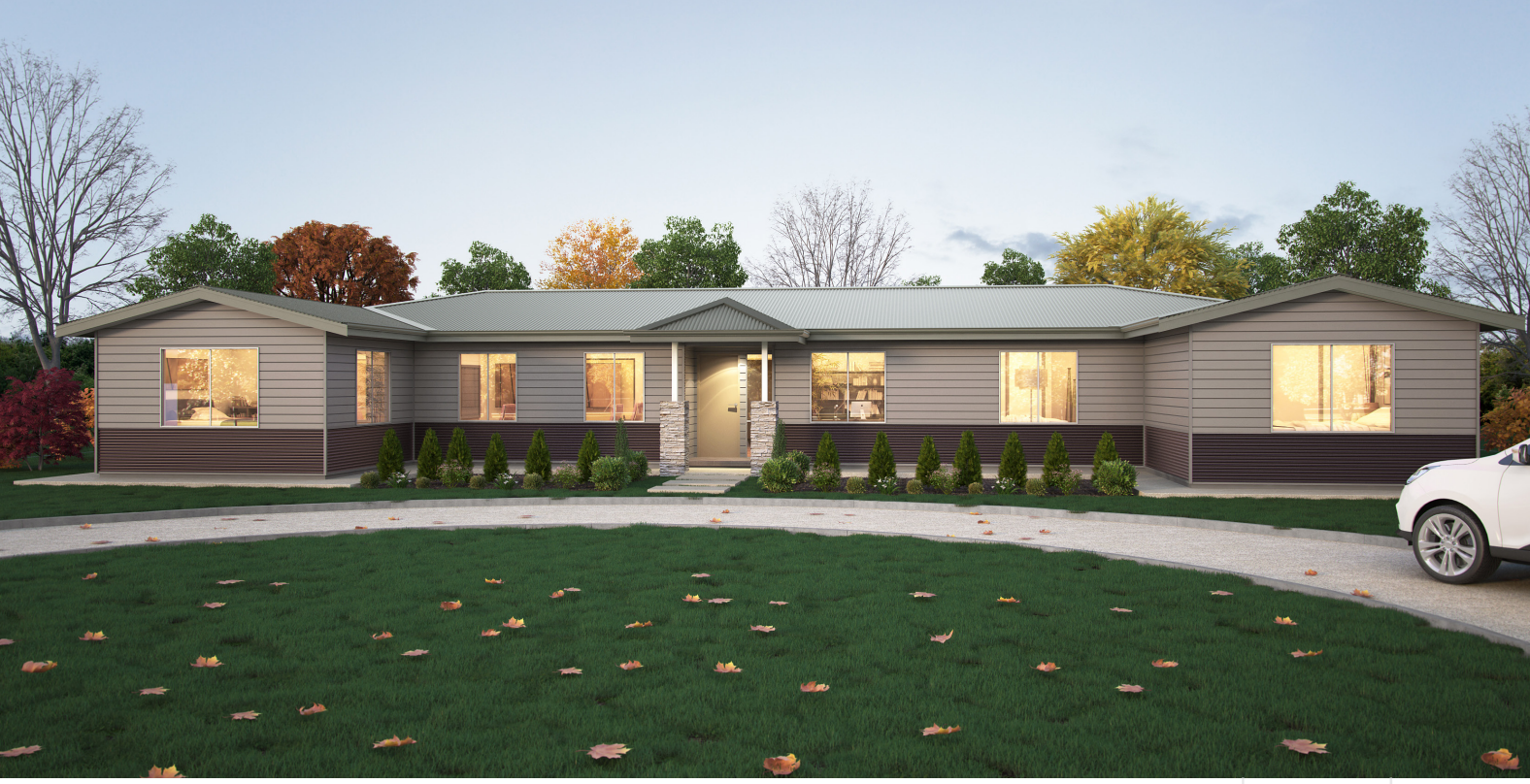
* Elevation is for illustration purposes only

Designed for large sites and country-style family living, the magnificent Murchison is an epic five bedroom, two bathroom home boasting a study, home theatre and huge open-plan living area.